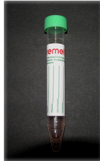
Viral Transport Media (VTM)

After collection: Place swab in viral transport media (VTM). Break swab shaft at score line. Discard top portion of shaft. Screw cap tightly on VTM container. Refrigerate.